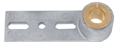
Standard Pivot Arm

These 19/32" (15 mm) diameter standard and heavy-duty Top Door Rail Pivot Arms fit in CRL Top Door Rails, and work with our 1NT401 Top Free-Swinging Pivot and CRL9040WBP Walking Beam Pivot.