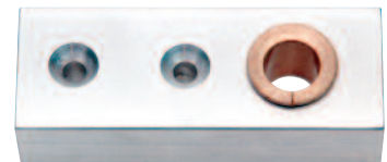
Heavy-Duty Pivot Arm