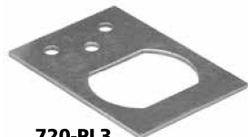
720-PL3 Anti-rotation plate