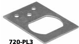
720-PL3 Anti-rotation plate

IMPORTANT: Medeco "Keymark" cylinders require Best compatible (small format) cabinet lock bodies (See 720LM/DM or 721DR/DW).